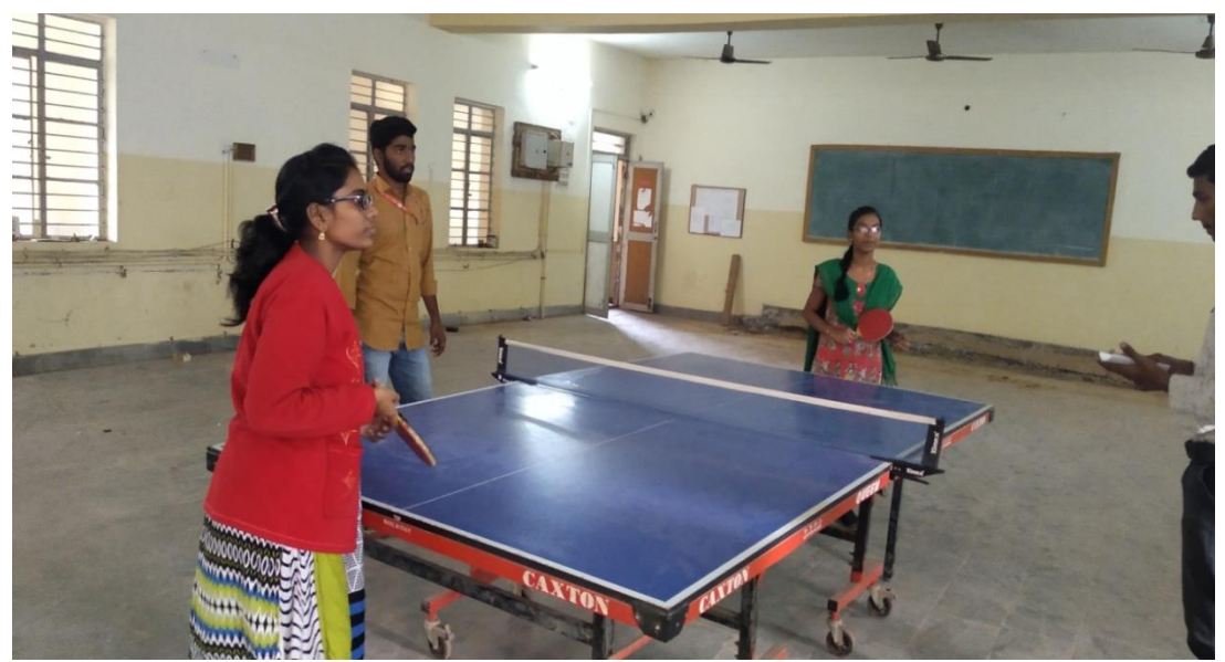
Table Tennis for Girls