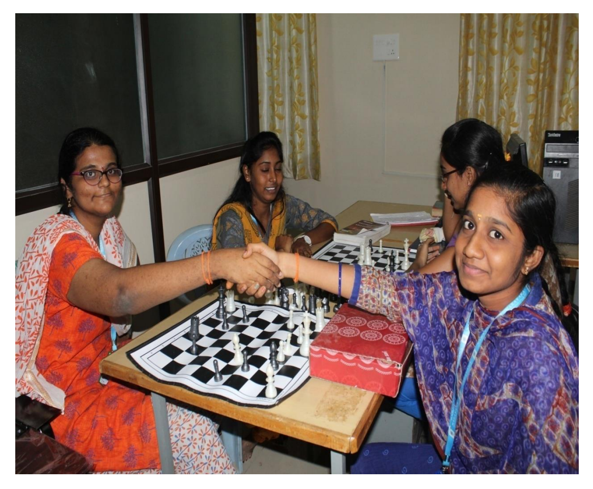
Chess Competition for Girls