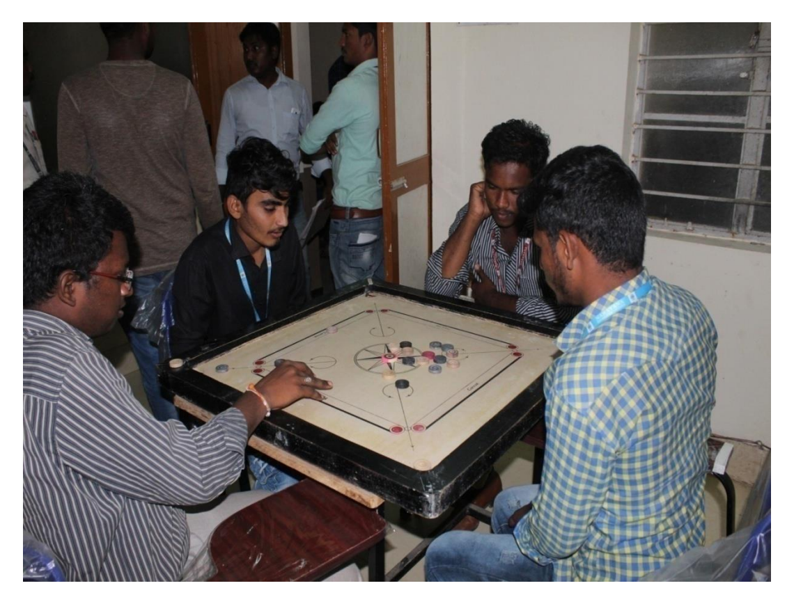
Boys playing Caroms